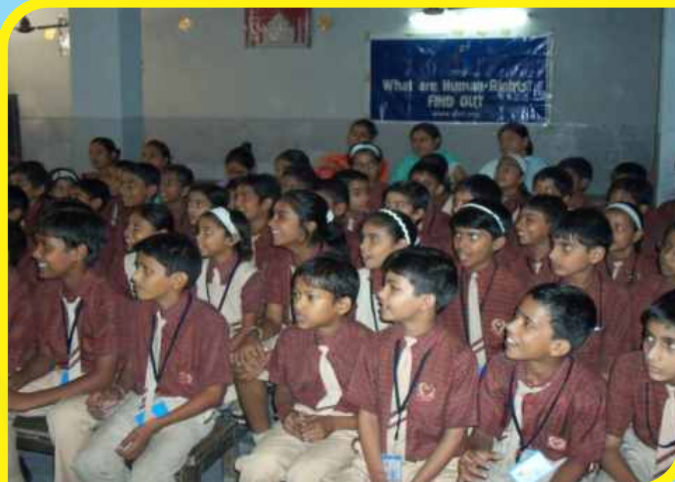
An interactive session held with 10-11 year old students of Aroma Public School, Chhatarpur, New Delhi on 23 Oct 2017