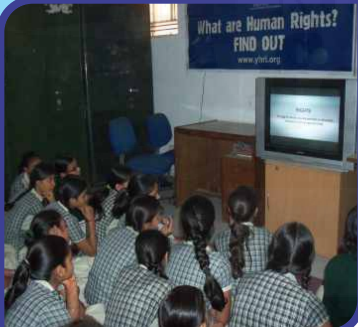
Students of Sarvodaya Kanya Vidyalaya, Mehrauli learning about rights through AV materials