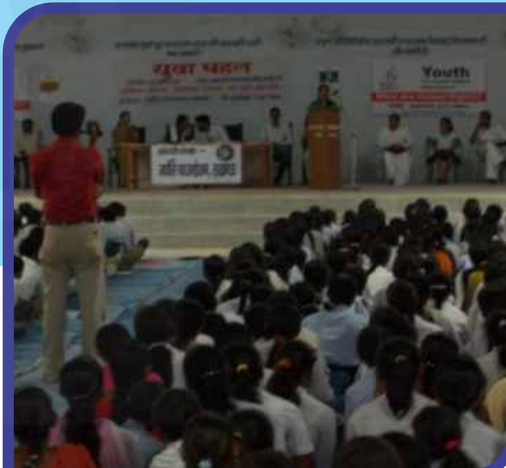
Human rights orientation session with about 1,000 students of a Government school in a village of Kanpur, India.